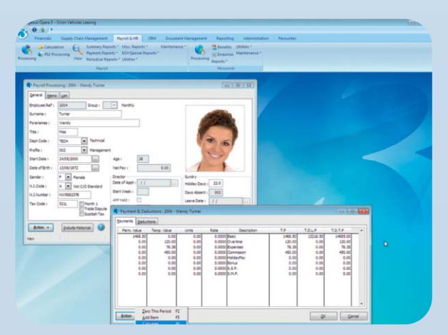
PAYROLL PROCESSING: PAYMENTS & DEDUCTIONS

To help employers who wish to implement salary sacrifice, Opera 3 Payroll includes salary sacrifice functionality as standard. This functionality caters for both pension and non-pension benefits. Salary sacrifice information is printed on the payslip. Pension salary sacrifice values are included in pension contribution reports and pension contribution files, and shown on the Employee History form.