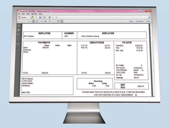
SEND PAYSLIPS BY E-MAIL

Of course, if paper payslips and P60s serve your company better, you can continue to produce them. Or you can use a combination of the two, with e-mail payslips for some employees and printed payslips for others.